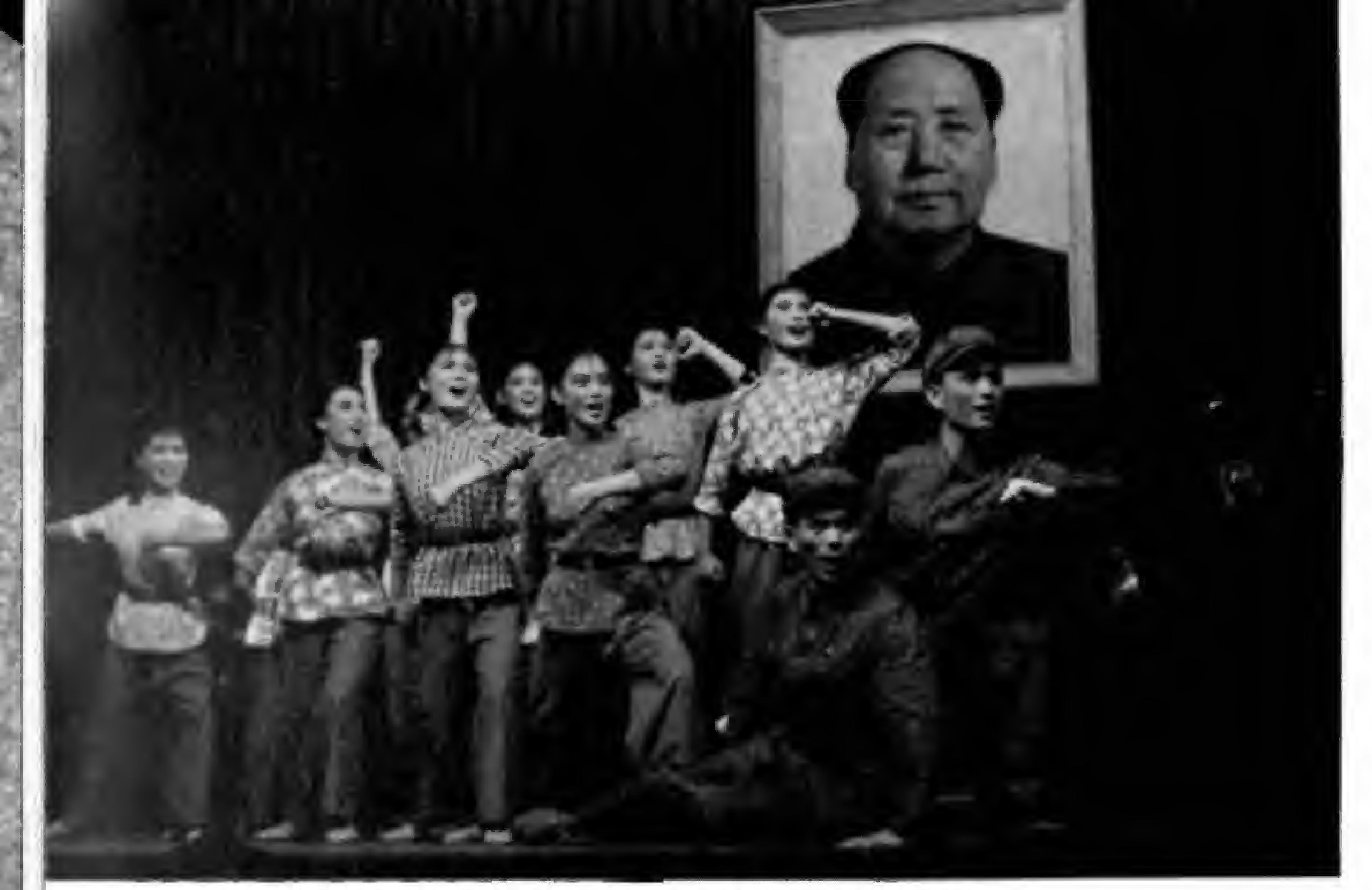
"The Sea Islands Are Good", a song and dance by the Seagoing Cultural Troupe under the army's Canton Command.